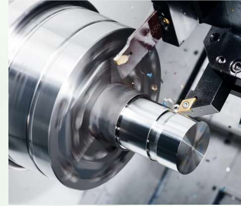
CNC Machine Shop