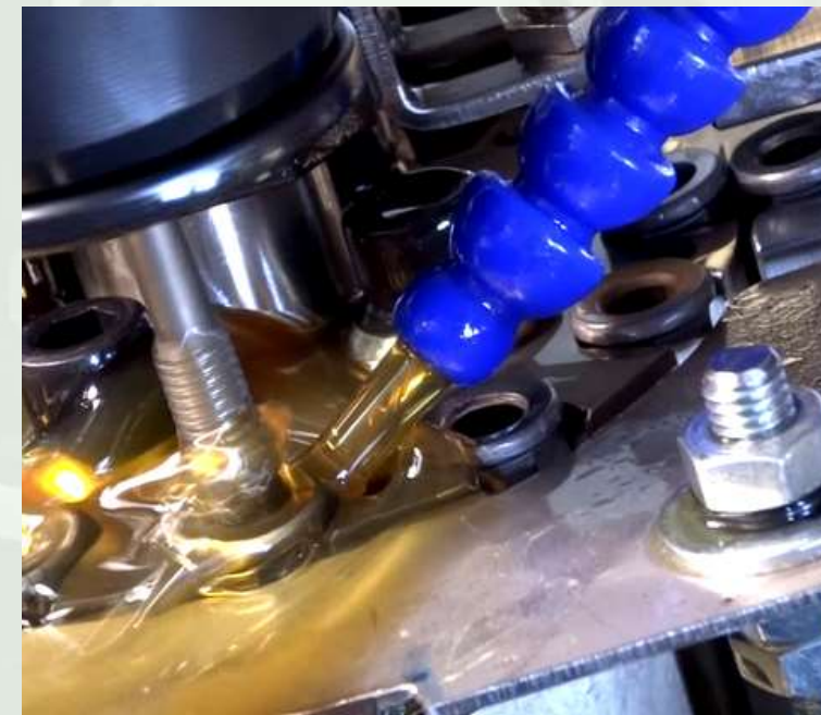
Special Purpose & Tapping Machines